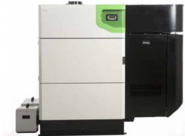
Retro Fit Boilers